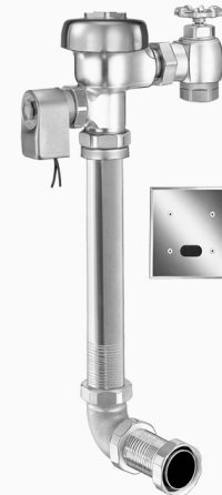
Image for a standard SLOAN 190 ESS shown

All information contained within this document subject to change without notice.