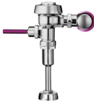
URINAL Royal 186-0.5 RW Royal 186-0.25 RW Royal 186-0.125 RW