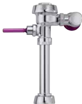
WATER CLOSET Royal 111-1.28 RW