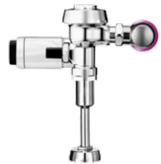
URINAL Royal 186-0.5 SFSM RW Royal 186-0.25 SFSM RW Royal 186-0.125 SFSM RW

Contact your Sloan distributor today, visit sloanvalve.com/reclaimed-water or call 800.982.5839 to learn more.