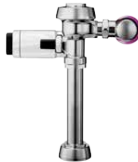
WATER CLOSET Royal 111-1.28 SFSM RW