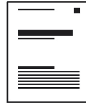
3 Installation and Owners Manual