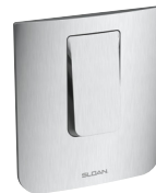
Brushed Stainless (PVDSF)