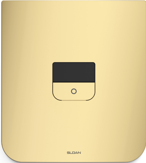
Polished Brass (PVDPB)