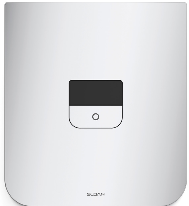
Sensor-Activated in Polished Chrome (CP)