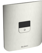
Brushed Nickel (PVDBN)