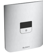
Brushed Stainless (PVDSF)