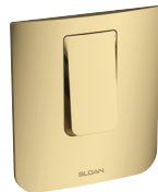
Polished Brass (PVDPB)