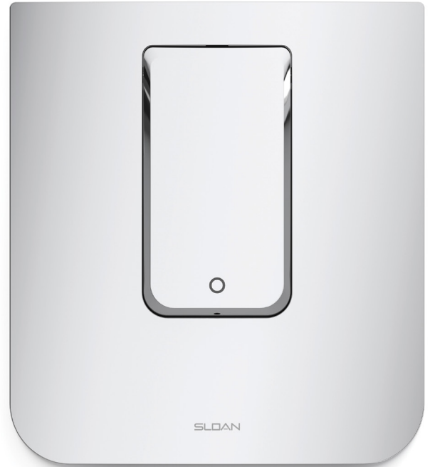
Manual in Polished Chrome (CP)

We've worked closely with architects and designers around the world to ensure that our efficient, water-saving products are also beautiful. With a choice of Polished Chrome or 4 attractive PVD finishes, including our newest color, Graphite, the CX allows you to make the statement of your choice that elevates your restrooms.