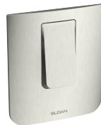
Brushed Nickel (PVDBN)