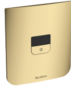
Polished Brass (PVDPB)