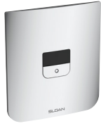
Polished Chrome (CP)