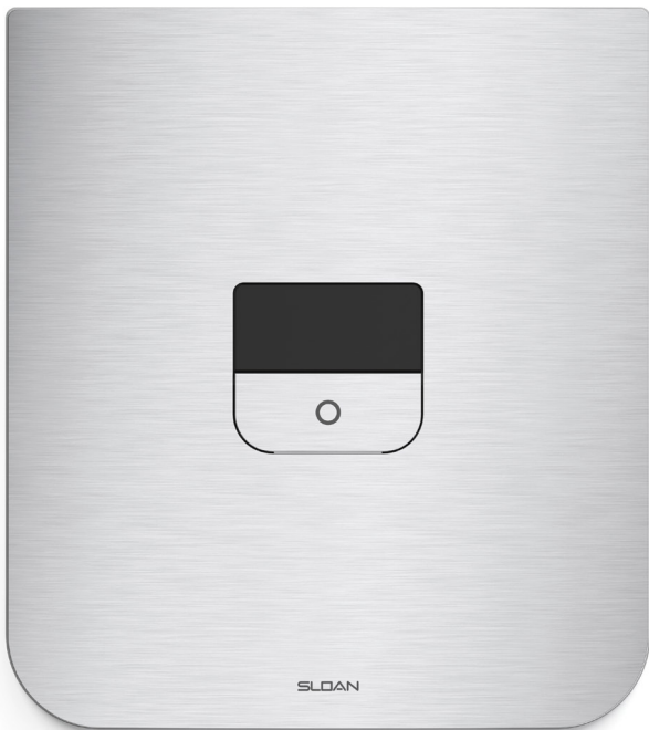
Brushed Stainless (PVDSF)