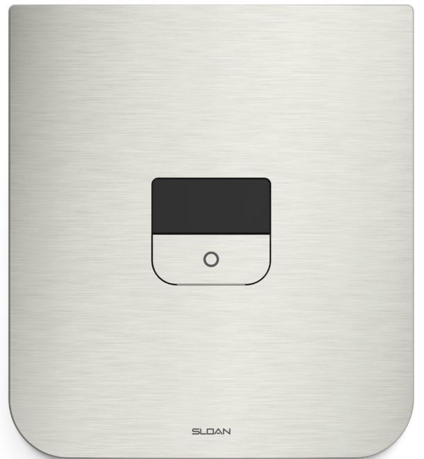
Brushed Nickel (PVDBN)