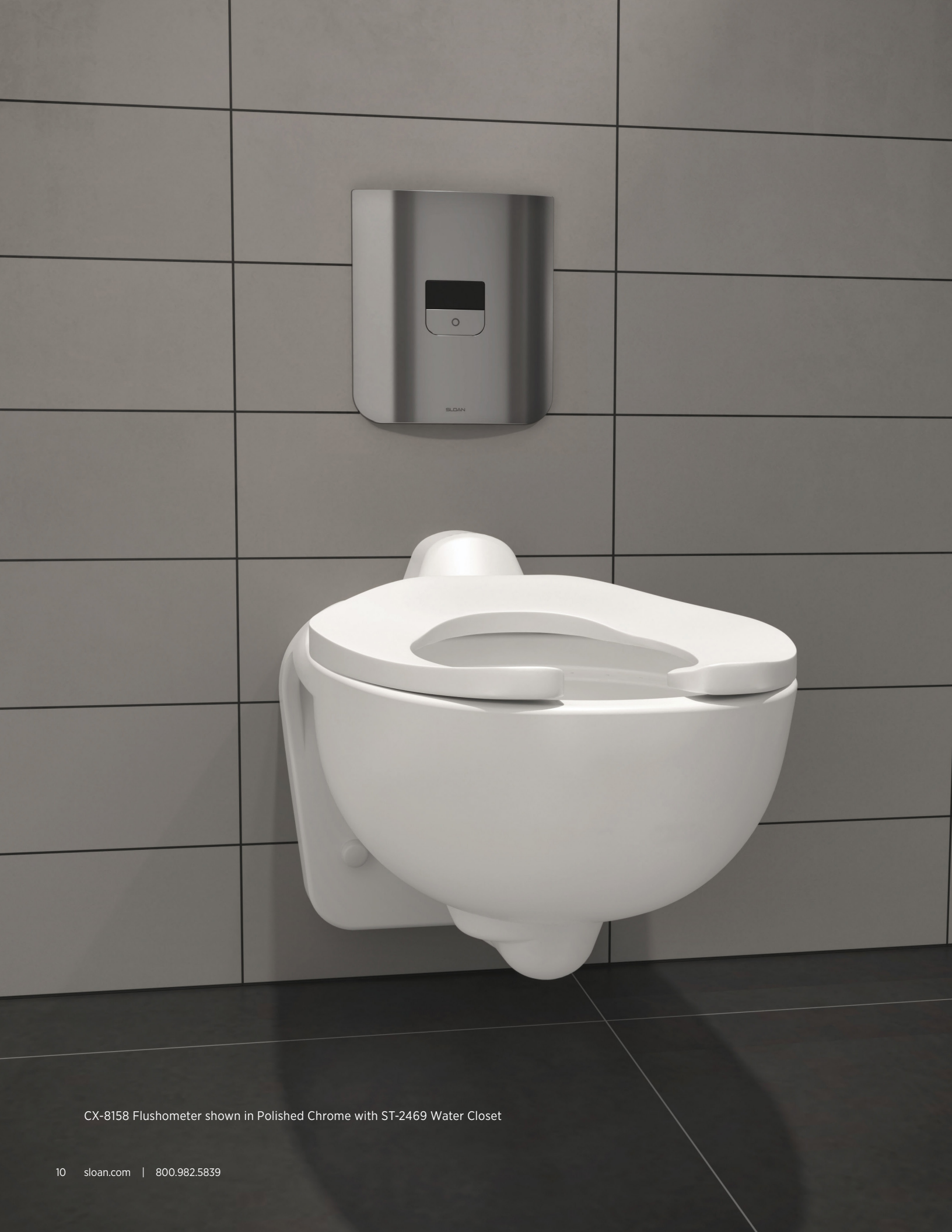
CX-8158 Flushometer shown in Polished Chrome with ST-2469 Water Closet