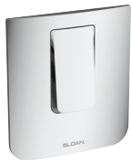
Polished Chrome (CP)