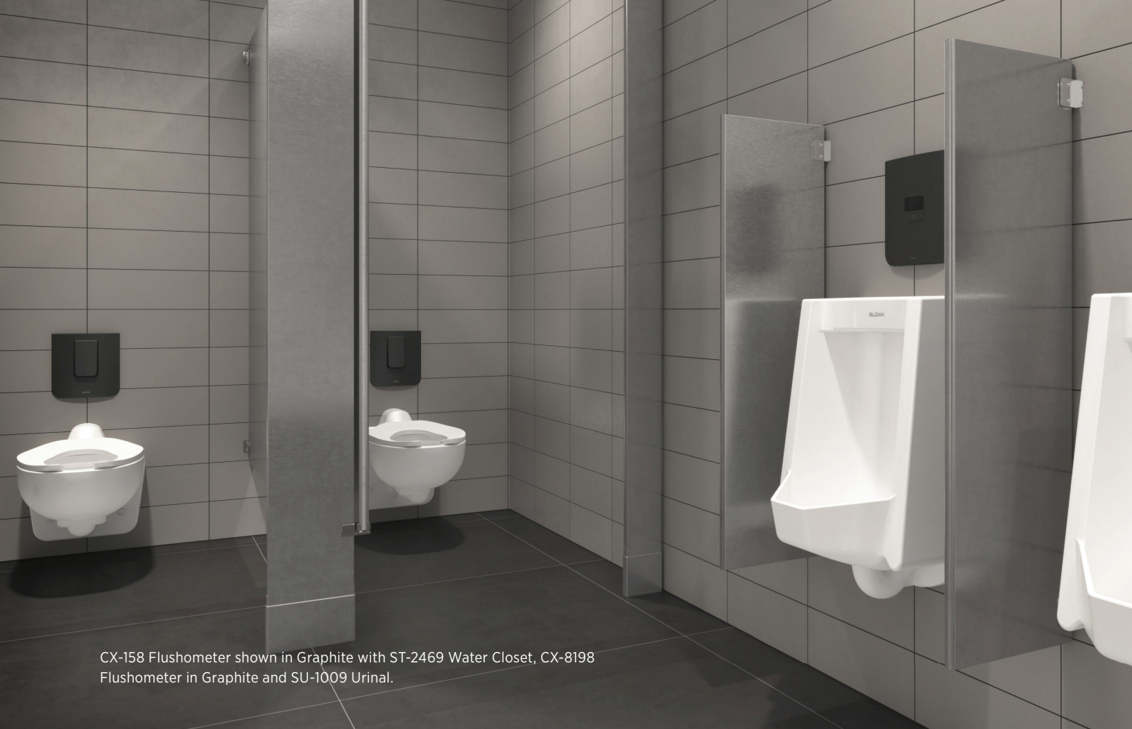
CX-158 Flushometer shown in Graphite with ST-2469 Water Closet, CX-8198 Flushometer in Graphite and SU-1009 Urinal.