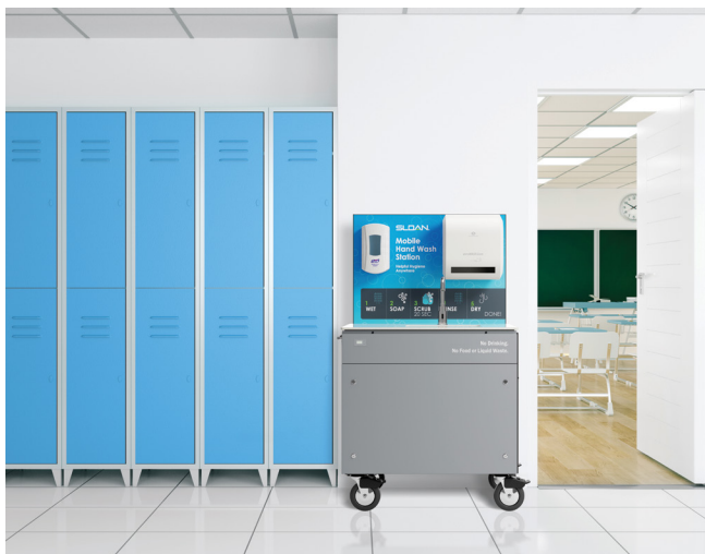
Universities and Schools