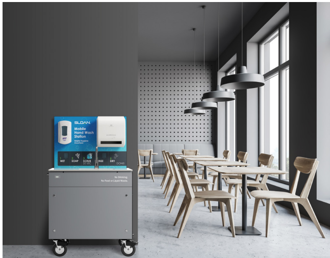
Cafeterias and Food Courts

We've created a customizable hygiene station on wheels that pairs attractive design with the durability you expect from Sloan. It's a simple solution that helps your facility enhance health, wellness, and hygiene.