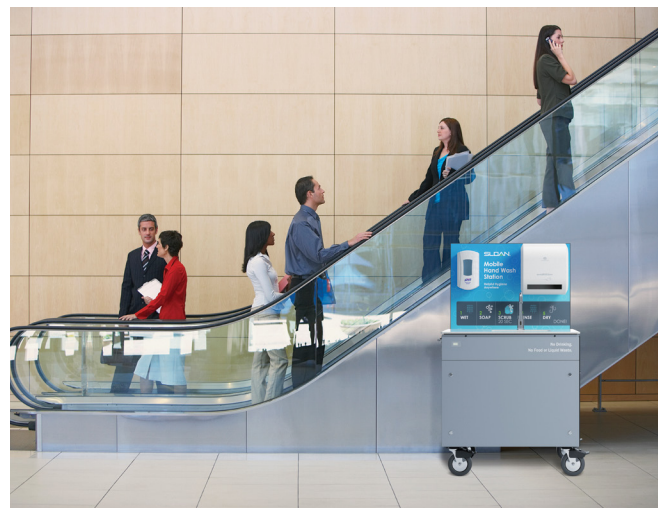
Convention Centers and Retail Environments