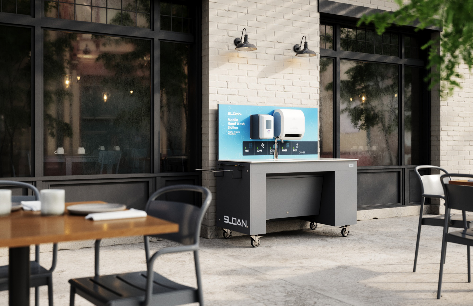
MH-4000-ADA Mobile Handwashing Station in outdoor setting.