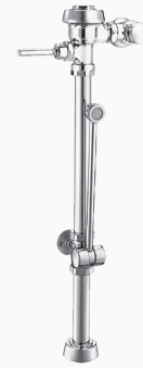
Variation Not Shown: Trap Primer